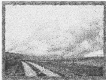
Dirt Roads - by Paul Harvey

Poems, Sayings, Quotes for Senior Citizens Poems, Sayings, Quotes for Grandparents One Hundred Years Ago Current Census Bureau Statistics Share Your Wisdom Happy and Successful People Over the Age of 50 Links