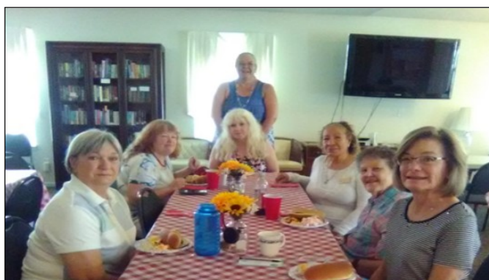
Above is pictured part of our "gang" attending our summer picnic. We have room in this picture for you!