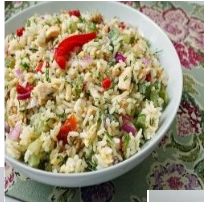
Fresh Homemade Salads