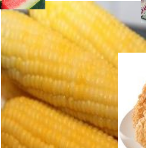
Fresh Picked, Locally grown Corn on the Cob