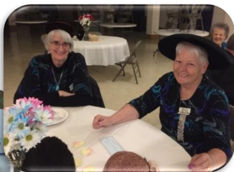
Moms and a variety of hats from the 1940s and 50s, which brought back many fond memories.