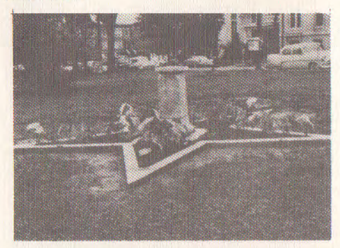
MONUMENT IN SMITH PARK Jackson, Mississippi

The restoration of the Little Red Schoolhouse is now nearing completion, and the noble heritage of Eastern Star members in Mississippi will be perpetuated in the preservation of this Shrine, the Birthplace of the Order of the Eastern Star.