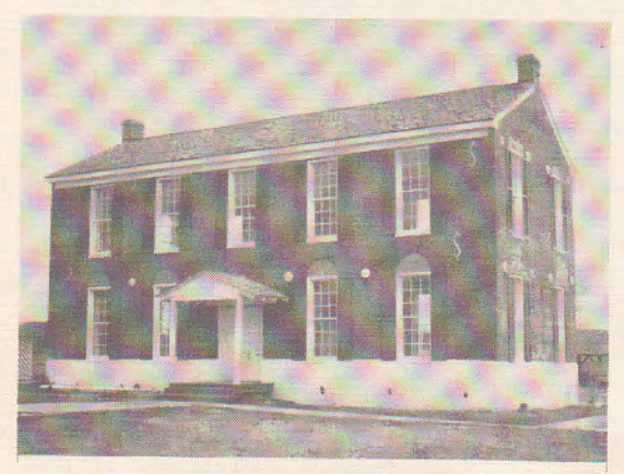
LITTLE RED SCHOOLHOUSE Richland, Mississippi