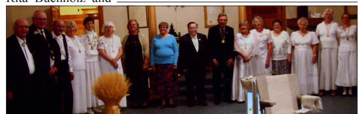
Colorado #2 Past Matrons and Past Patrons